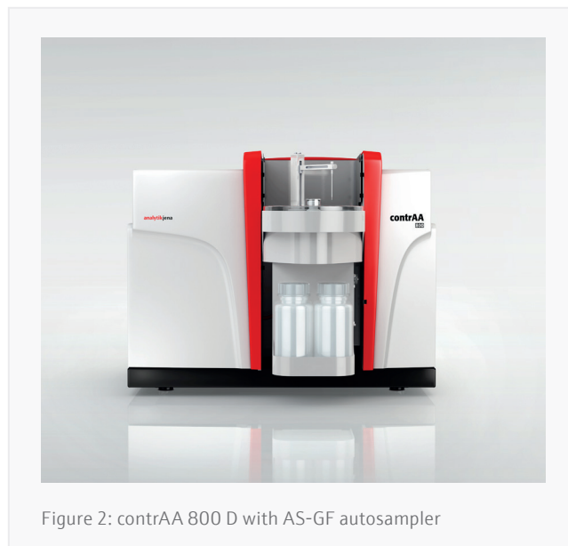
Figure 2: contrAA 800 D with AS-GF autosampler

The quantification of PFAS in different solid samples as a sum parameter can be carried out very quickly and easily with the described EOF method using the contrAA 800. The applied sample preparation is commonly used for the analysis of solid samples such as sludges, soils, and sewage sludges. Also the analysis of other solid materials, like fibers and textiles, is conceivable. The detection method of fluorine in the extracts by means of the molecular absorption of the in situ formed gallium monofluoride with the contrAA 800 is fully automatable and highly efficient in detection. The results of the EOF measurements for sewage sludge are significantly higher compared to the EOF value for soil. The reproducibility was checked by one sample and is very good at about 2%. The recovery of an organic fluorine compound was determined up to 90%. In addition to single-substance analysis, the EOF determination with the contrAA 800 is a useful screening method for fluorinated organic compounds. The results can be determined relatively quickly and thus allow a faster action possibilities. Unknown compounds, which can be formed by chemical