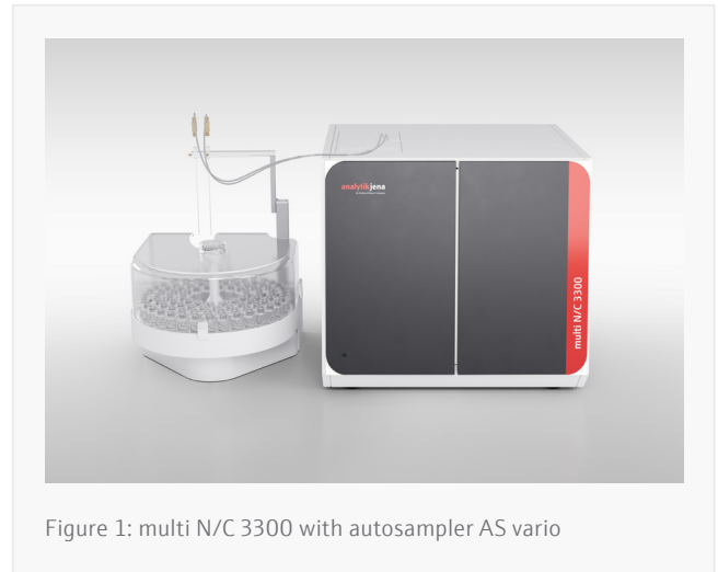
Figure 1: multi N/C 3300 with autosampler AS vario

The multi N/C 3300 is ideally suited for the determination of TOC/DOC according to DIN EN 1484. Fast, reliable and standard-compliant routine analysis is guaranteed at all times with this instrument. For additional TOC